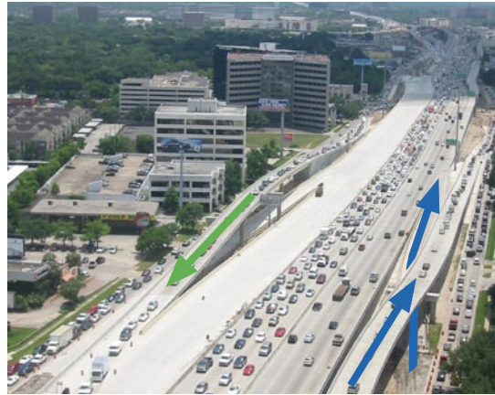
Looking south from San Felipe

Commuters now have a new option when traveling in Uptown Houston. The new northbound Westheimer entrance ramp to IH-610 (West Loop), pictured at right in green, opened last month! In addition, commuters have enjoyed the southbound Westheimer entrance and exit ramps, shown in blue, for several months.