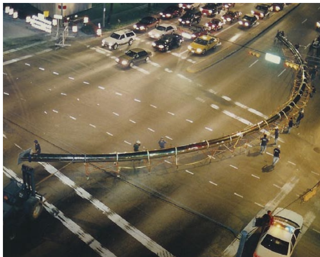
Traffic stops temporarily as crews move an arch to its permanent location.

In 1992, Uptown Houston fabricated and installed six pairs of stainless steel arches along Post Oak Boulevard.