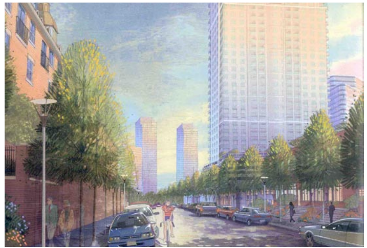
Illustration of McCue Street at completion

The West Loop reconstruction project, from IH 10 to US 59, will be complete at the end of 2006.