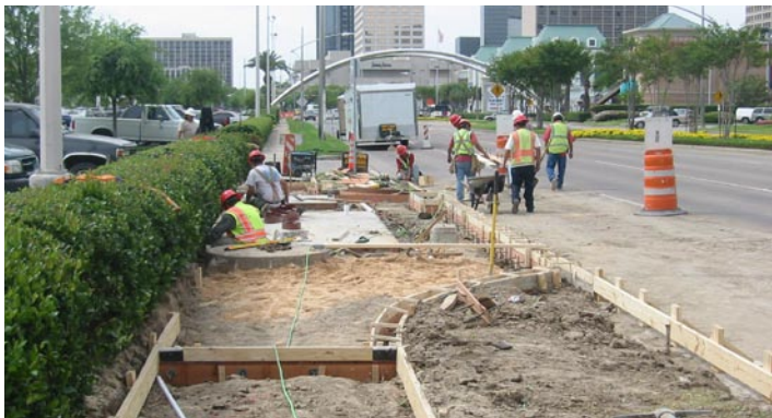
Construction crews ready sites for new METRO bus shelters in Uptown.