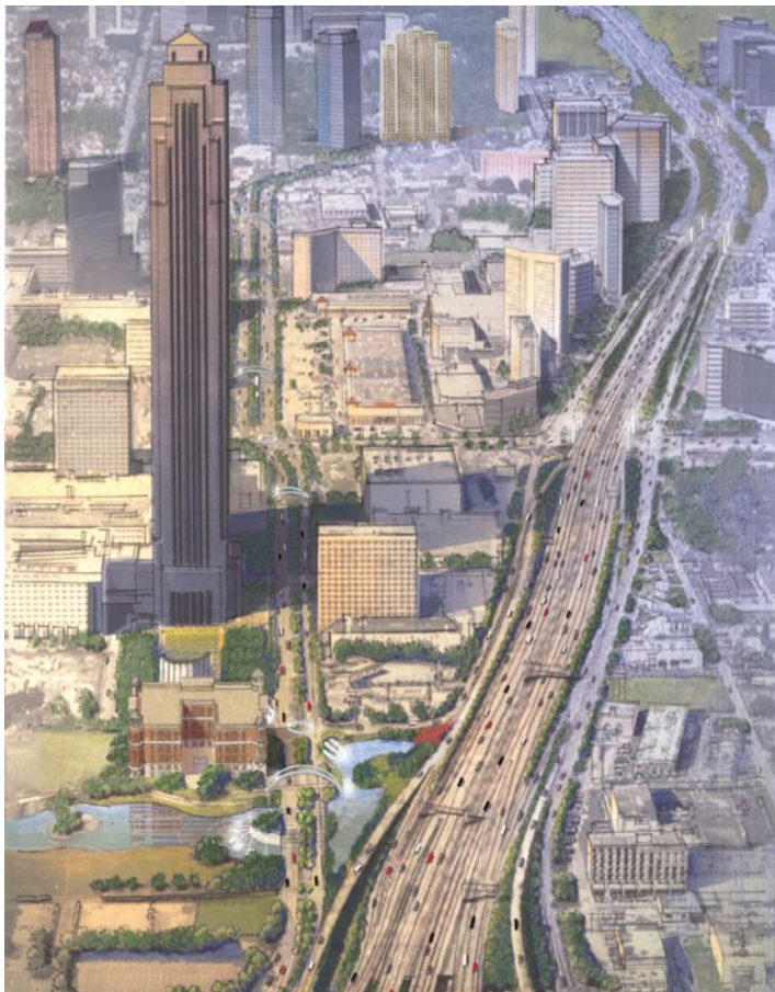
The West Loop reconstruction project, from IH 10 to US 59, will be complete at the end of 2006.